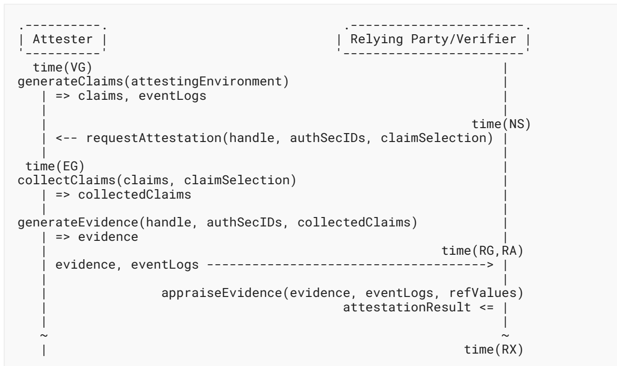
Figure 3: IETF Attestation Information Flow

Once the prerequisites for RIV are met, a Verifier is able to acquire Evidence from an Attester. Figure 3 illustrates a RIV information flow between a Verifier and an Attester, derived from Section 7.1 of [RATS-INTERACTION-MODELS] . In this diagram, each event with its input and output parameters is shown as "Event(input-params)=>(outputs)". The event times shown correspond to the time types described within Appendix A of [RFC9334] :