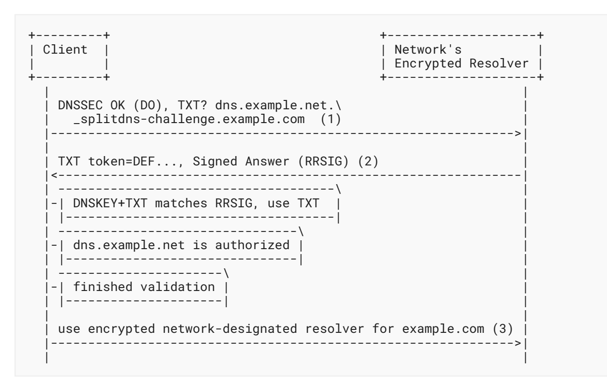
Figure 4: An Example of Verifying Claims Using DNSSEC